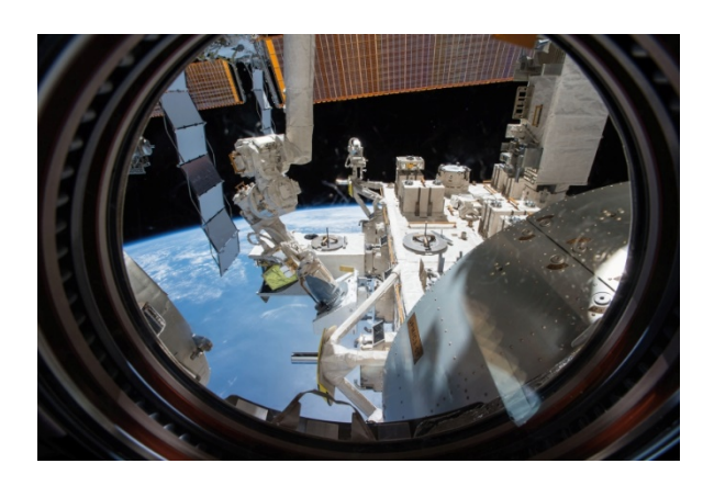
Fig. 1 The sensor system to observe areas of the Earth will be installed aboard the International Space Station (ISS).